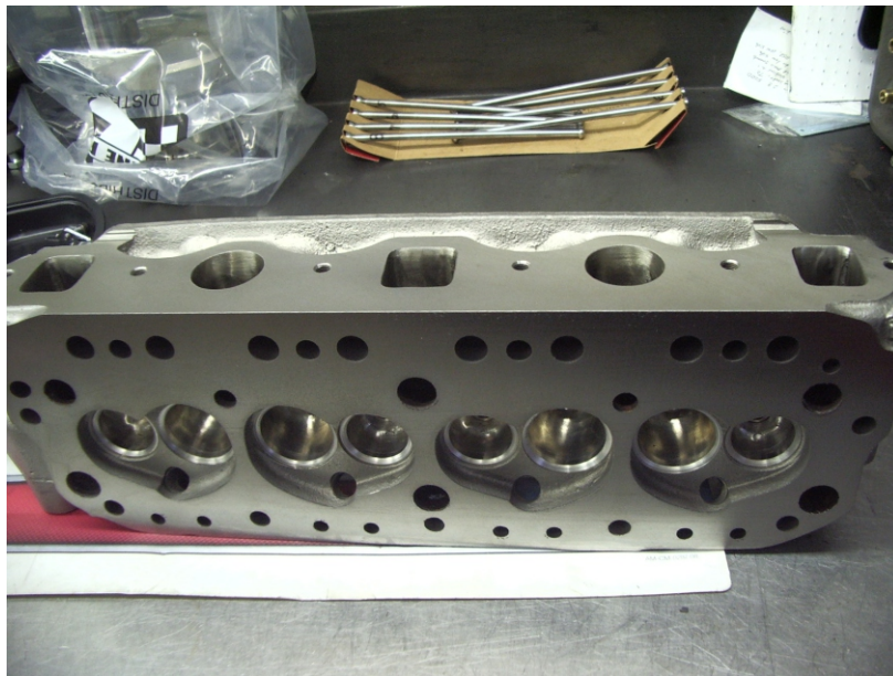
Cylinder Head Ready for Assembly