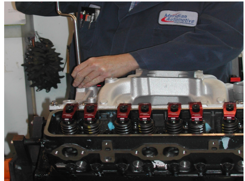
Final Assembly of Engine