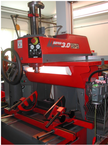
Seat & Guide Machine